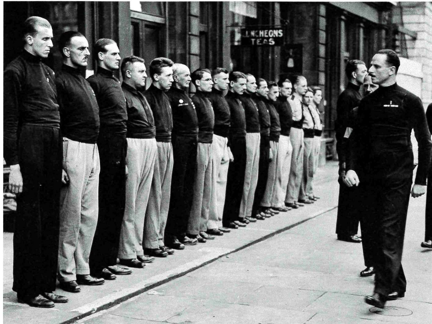
Mosley inspects an assembly of 'Blackshirts', c.1935

Was British fascism ever a real player in British politics? What influence did Sir Oswald Mosley gain over major political events?