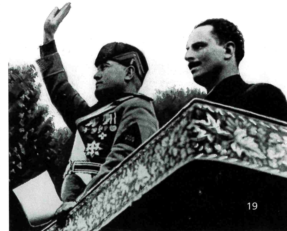
Mosley stands with Italian fascist dictator Benito Mussolini in Rome, 1943

Mosley launched the British Union of Fascists (BUF) with a small band of followers to 'win power for fascism'. Recruits wore black shirts modelled on