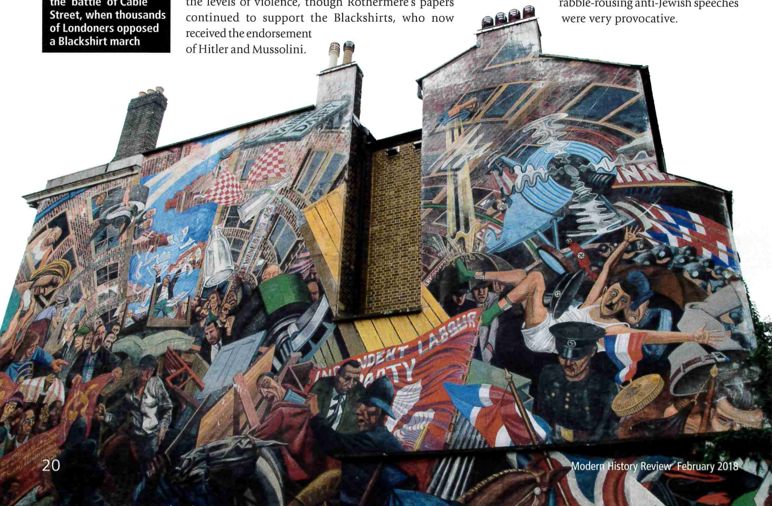
A mural commemorates the 'battle' of Cable Street, when thousands of Londoners opposed a Blackshirt march

The actions of the Nazis resulted in one of the greatest tragedies in human history: the Holocaust and the killing of 6 million Jews. However, there